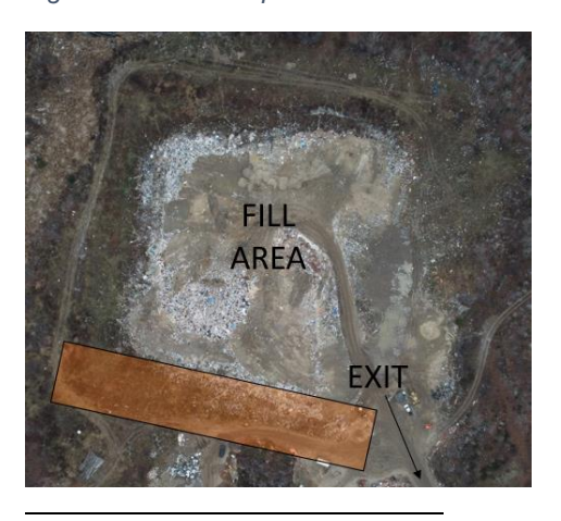
Figure 1 - Interim Expansion Area

In 2023, the current landfill was expected to reach capacity as soon as Spring 2024<sup>1</sup>. The Town has been able to extend the capacity past this date through work with the site contractor to improve sloping of the banks as well as pushing the landfill face to the full extent of the approved area. An interim expansion has been applied for to provide additional volume in the event that we run out of capacity prior to approval and construction of the expansion.